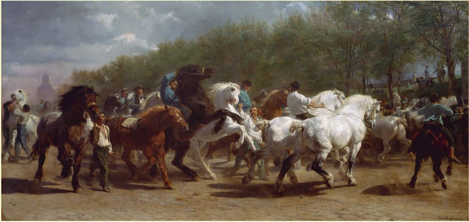
Rosa Bonheur (French, 1822–1899), The Horse Fair , 1853–55; oil on canvas; 96 1/4 x 199 1/2 in.; Gift of Cornelius Vanderbilt, 1887 (87.25)