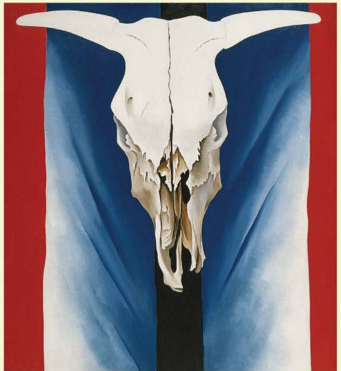
Georgia O'Keeffe (American, 1887–1986), Cow's Skull: Red, White, and Blue , 1931; oil on canvas; 39 7/8 x 35 7/8 in.; Alfred Stieglitz Collection, 1952 (52.203)

Did you know? Georgia O'Keeffe is considered one of the most important women artists. Her painting Red Poppies was even reproduced on a US postage stamp.