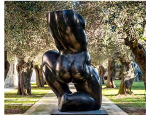
Sculpture on the grounds of Hotel La Fiermontina, Lecce

Located within the ancient city walls and just a pleasant ten-minute stroll from the middle of Lecce in a quiet area of the city, La Fiermontina offers a modern, artistic take on a beautifully restored masseria .