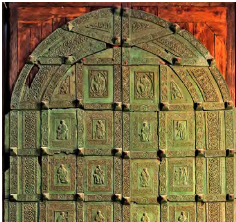
Bronze doors, Cattedrale di Trani