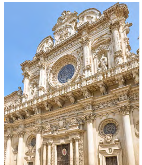
Basilica di Santa Croce, Lecce