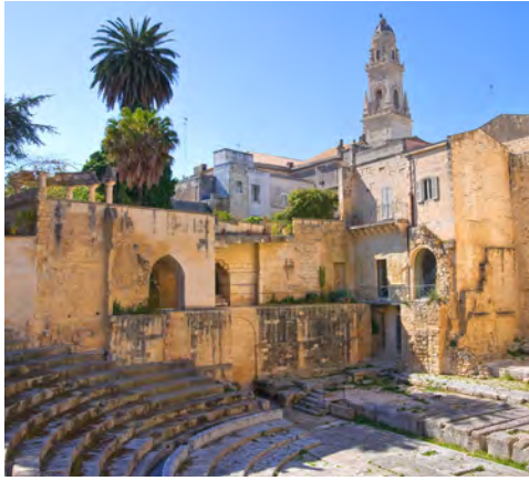
Roman amphitheater, Lecce