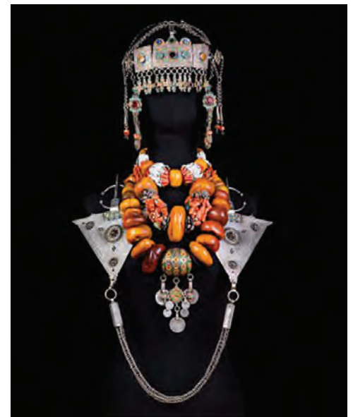
Berber Museum, Marrakesh