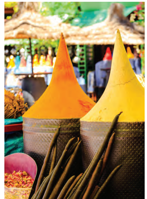
Photos clockwise from top right: Map of the region; Chefchaouen; Spice stall in Marrakesh market, Morocco; The Nejjarine Funduq, Fes; Villa Oasis, Marrakesh; Ceramic decoration of Hassan II Mosque. Front cover: Marrakesh architecture. Back cover: Tannery district, Fes (top) and Marrakesh and the Atlas Mountains (bottom).