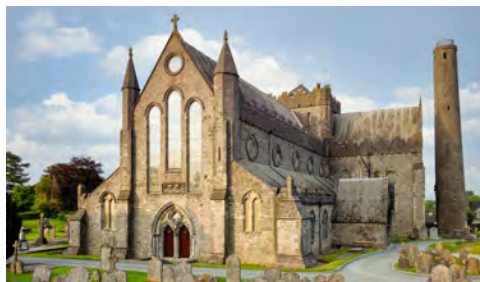
St. Canice's Cathedral, Dublin

Depart Dublin and travel south to the charming medieval town of Kilkenny. En route, stop at Russborough House, which sits in the heart of the panoramic West Wicklow landscape, for a private tour. The plasterwork, furnishings, and landscaped gardens—including the delightful Lady's Island—make Russborough House one of the finest great houses in Ireland. Lunch will be at the Tulfarrin Hotel, an 18th-century manor house set in 200 acres on the banks of Blessington Lakes. In the afternoon, visit Heywood Gardens, a tranquil and romantic hillside escape with a vista that takes in seven counties. Overnight at the Lyrath Estate, which features 170 acres of Irish countryside complete with picturesque lakes and historic gardens. Dinner is at the hotel this evening. B, L, D