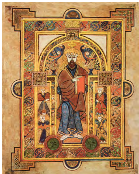
Book of Kells, Trinity College