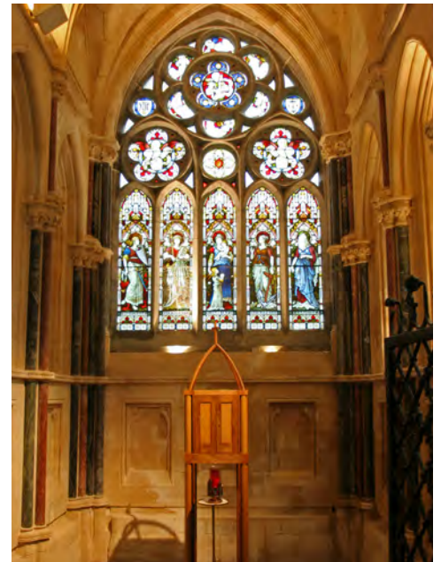
Kylemore Abbey, Galway