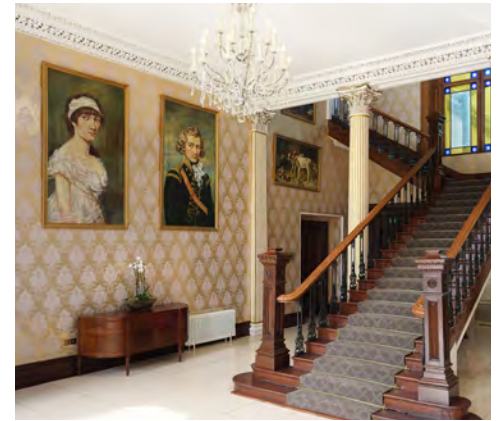
Lyrath Estate Hotel, Kilkenny

Ireland's most magical address has been welcoming guests since the 16th century. As the ancestral home of the O'Briens of Dromoland, this castle's lineage dates back 1,000 years to Brian Boru, one of the last High Kings of Ireland.