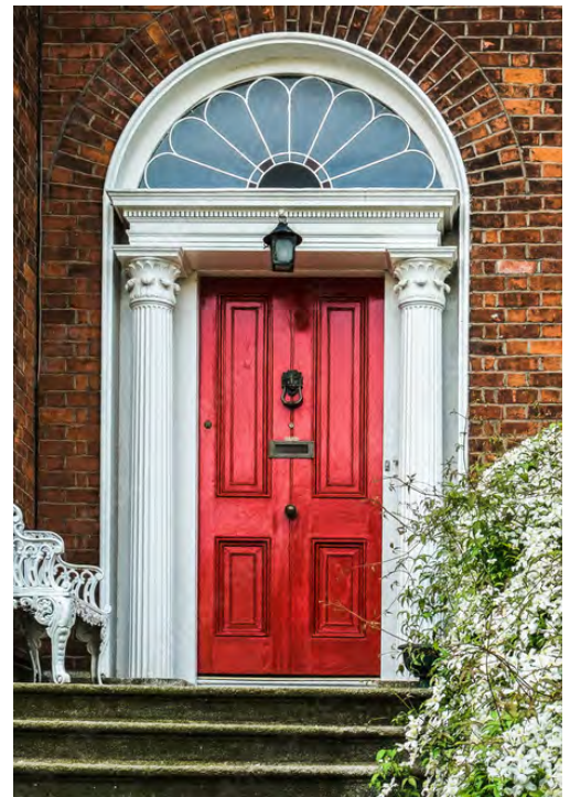
Photos clockwise from top right: Map of the region; Heywood Gardens, Kilkenny; Georgian door, Dublin; Dromoland Castle (interior); Birr Castle, photo © Tourism Ireland, courtesy of Chris Hill; St. Patrick's Cathedral (interior), Dublin. Front cover: Powerscourt House & Gardens, Dublin, photo © Tourism Ireland, courtesy of Chris Hill. Back cover: The Long Room, Trinity College, Dublin, photo © Tourism Ireland (top); and Cliffs of Moher (bottom).