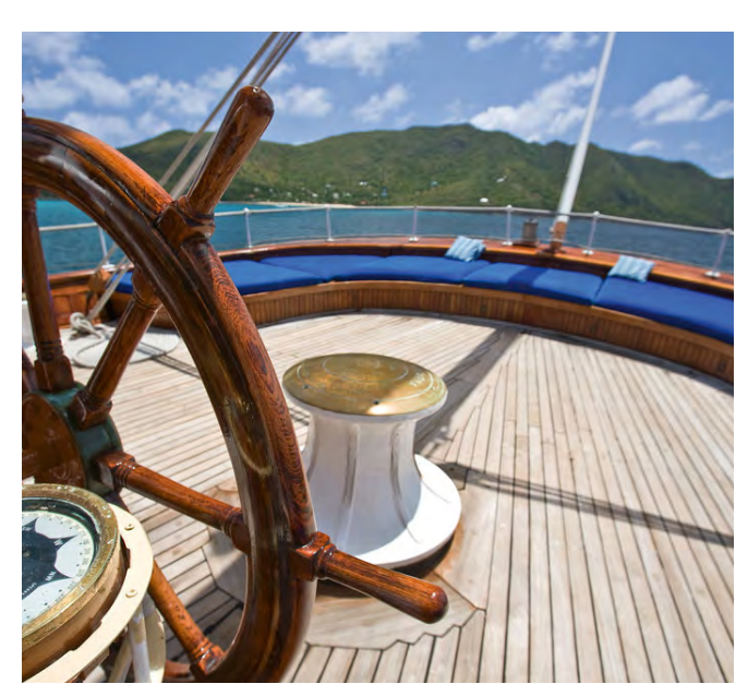
On deck, Sea Cloud