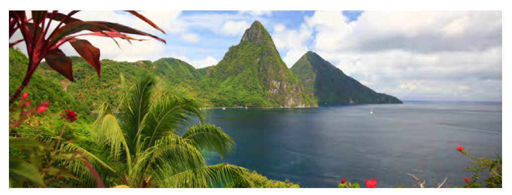
Anse de Pitons, St. Lucia