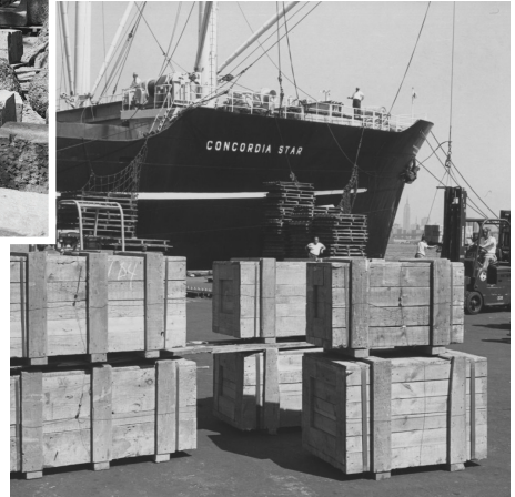
Right: The crates being unloaded after the long journey to the United States.