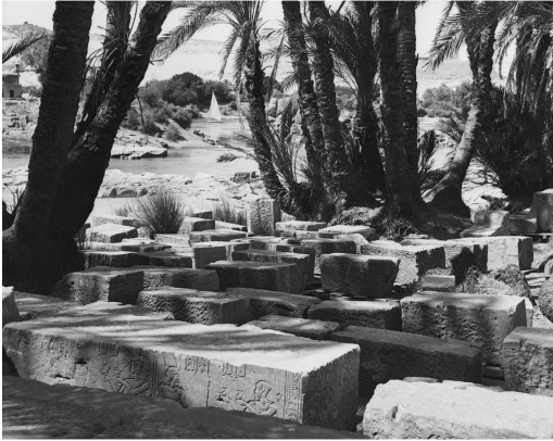
Above: The temple blocks waiting to be packed into crates in Egypt.

Egypt gave this temple to the United States as a gift. It was taken apart in Egypt, packed into 660 crates, transported by ship, and put back together again, block by block, at The Met.