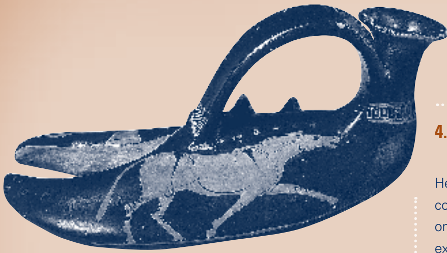
Terracotta vase in the form of a lobster claw ; Greek, Attic, red-figure, ca. 460 B.C.; attributed to the Class of the Seven Lobster-Claws; donkey; keras (drinking horn); Rogers Fund, 1923 (23.160.57)

Design a cup, plate, or pitcher shaped like an animal or part of an animal. Who would use it? When would it be used?